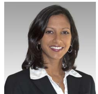
Dr. Lipika R. McCauley M.D.

Bladder injections: the use of botulinum toxin or also known as Botox, became an FDA approved procedure for overactive bladder in mid 2012. Small doses of Botox injected into the bladder muscle temporarily paralyze the bladder muscle, therefore decreasing overactivity and incontinence. The treatment can often wear off and requires repeat injections every 6 to 9 months.